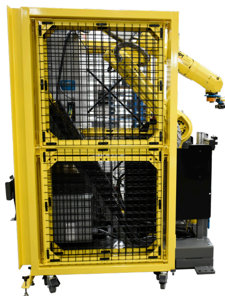
Folded: 72" deep x 54" wide x 88" high